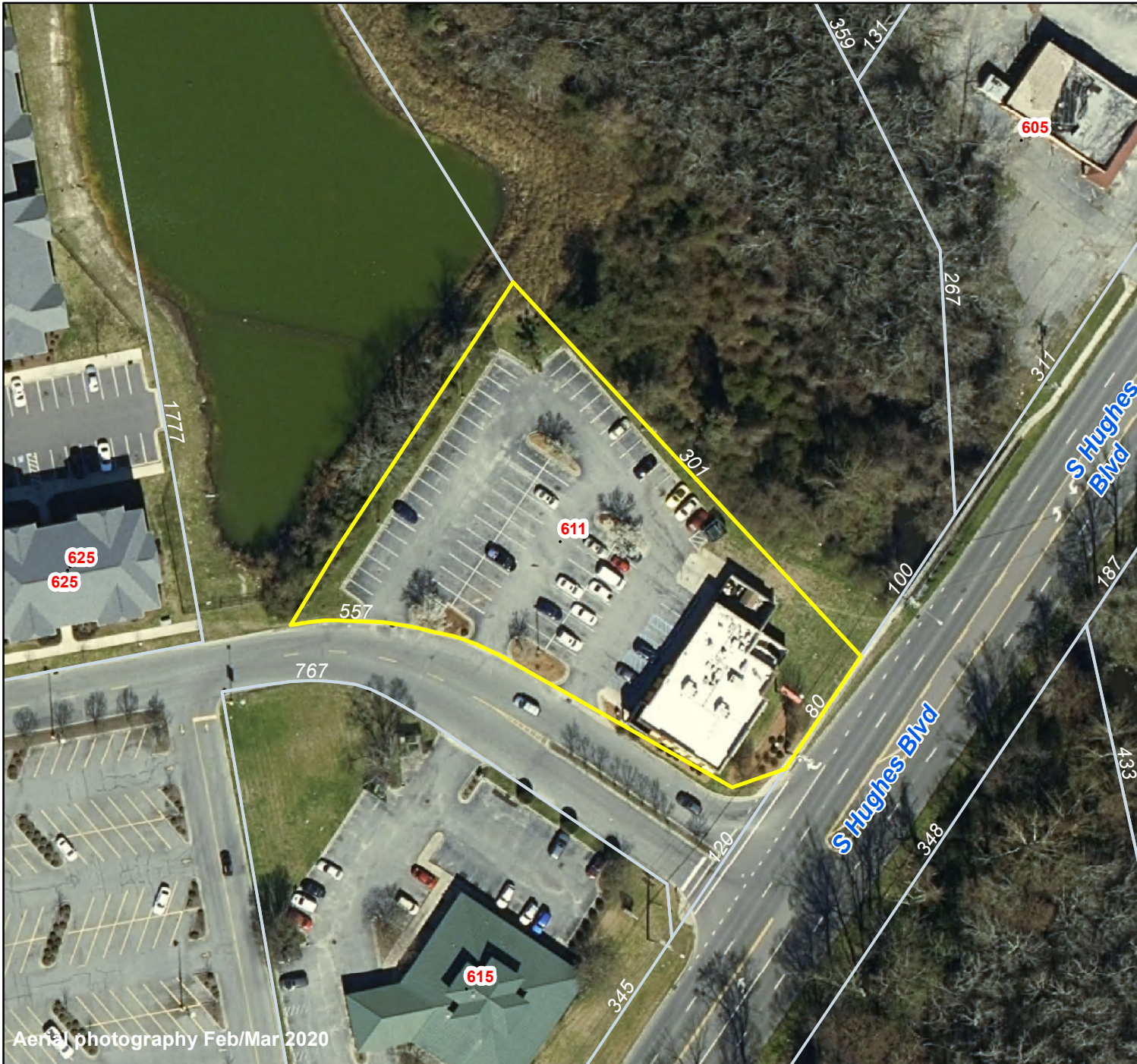
Aerial photography Feb/Mar 2020